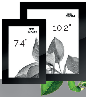
PicoSign ePaper displays